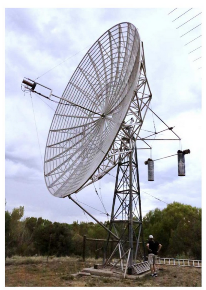
The 30-foot dish in the sideways position. This position presented the first challenge to the crew and the crane operator.

In 2009, a few members heard about a 60-foot parabolic dish antenna for sale in Haswell, Colorado, and bought it. That was the beginning of the amateur radio and astronomy alliance at DSES. Volunteers have completely restored the 60-foot radio dish, and it is now fully operational. It was once part of a Cold War-era tropospheric-scatter communication research project. Now it performs various functions as a powerful tool for amateur radio scientific discovery and public outreach, such as observing hydrogen line emissions at 1.42 GHz. mapping the