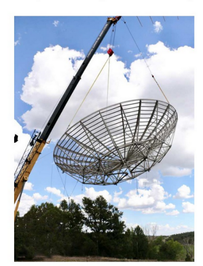
The dish lifted in the air by a crane and rotated to the birdbath

Finally, we unloaded the remaining struts, cables, weights, and feeds from Ray's trailer, tucked them in with the petals, and lashed them together. Lashing them together also served as loss prevention for all the parts and pieces. Once we were done, we left the site knowing the dish was safely stored for future assembly.